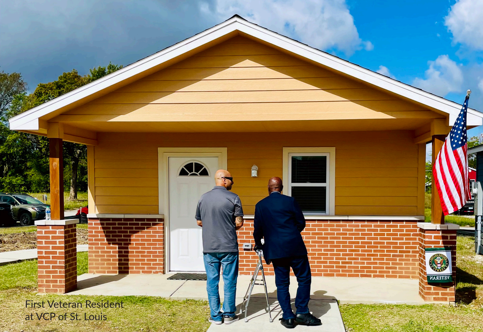
First Veteran Resident at VCP of St. Louis